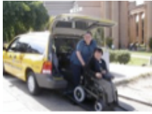
Share a fare